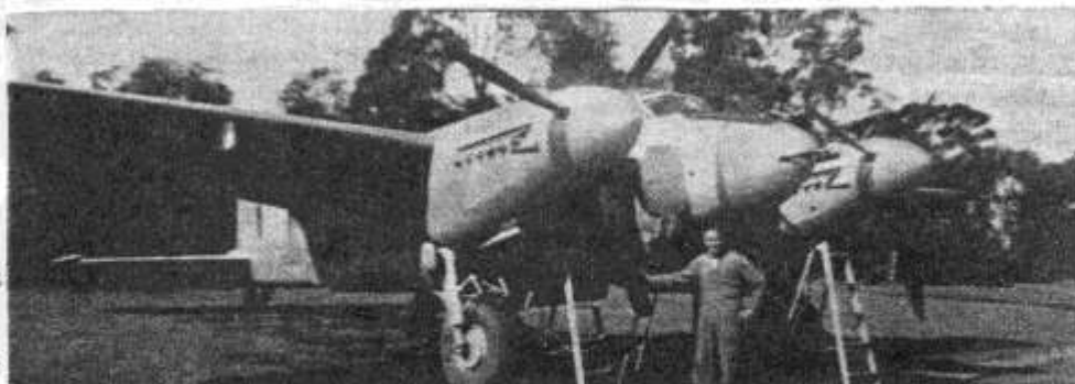
This photo of a RAAF mechanic standing in front of a de Havilland Mosquito was taken in August 1945 near the Nepean River in the Blue Mountains, NSW

Many other Members have forwarded photographs and information which will prove to be of help. This magic old aircraft (A52-600) has certainly given a lot of us a good shove in a new direction.